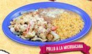
POLLO A LA MICHOACANA