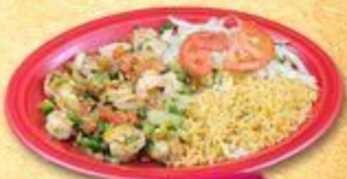
SHRIMP A LA MEXICANA