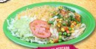
FILETE DE PESCADO