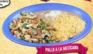
POLLO A LA MEXICANA