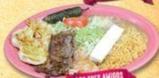
LOS TRES AMIGOS