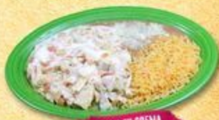
POLLO EN CREMA